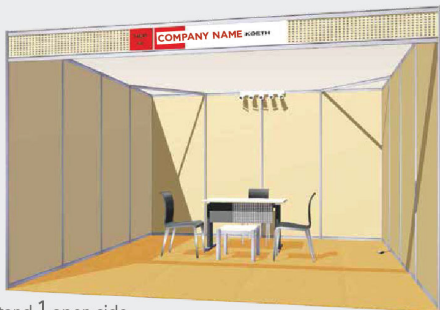
Stand 1 open side