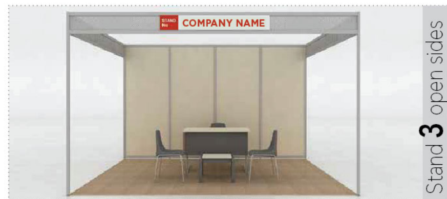
Stand 3 open sides